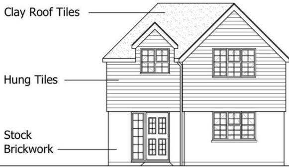
Proposed North-West (Front) Elevation Scale 1:100